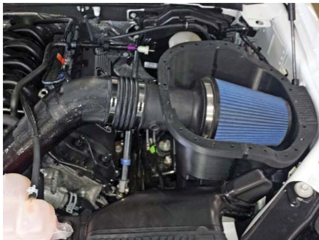
10. Attach the two (2) quick connect hoses to the mating barbs on the clean air tube.