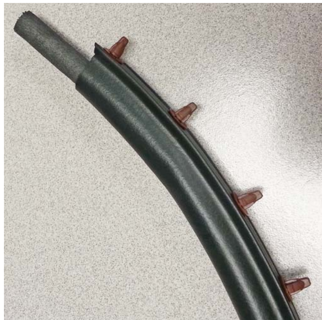
13. Install the air box seal starting in the location shown. You may need to trim the seal to the correct length. (Note: Start the seal at the middle of the inlet tube.)