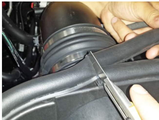
14. Place the EO sticker under the hood of your vehicle on a clean, metal surface.