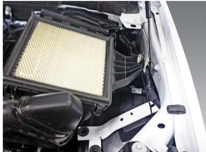
11. Remove the self-tapping screw retaining the dirty air inlet onto the lower air box.