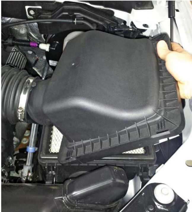
8. Remove the clean air tube from the vehicle.