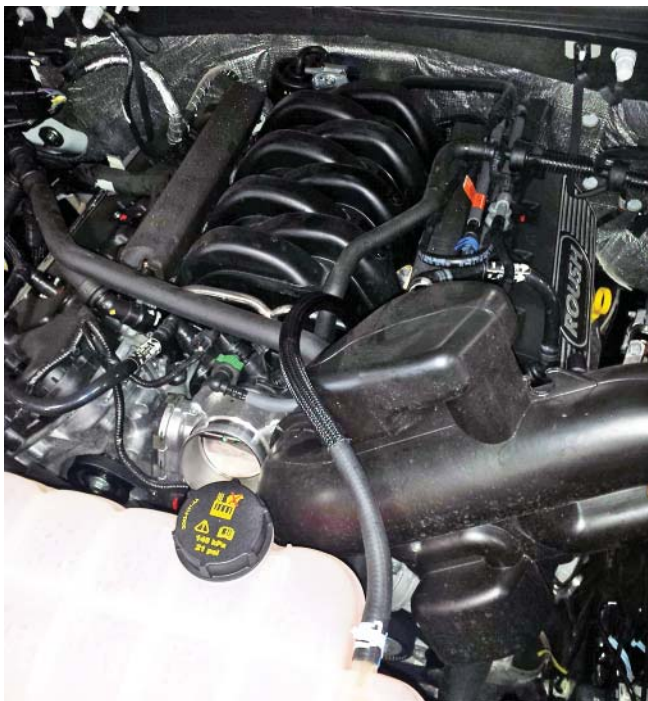
9. Remove the two (2) push clips retaining the dirty air inlet duct to the grill closeout.