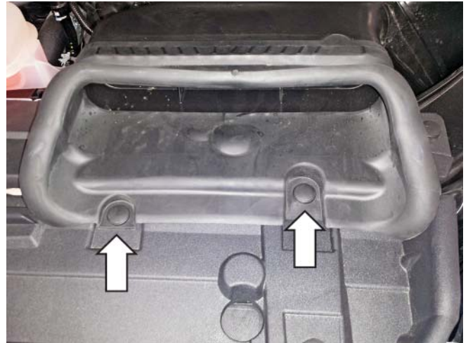
10. Remove the lower air box and dirty air duct from the vehicle.