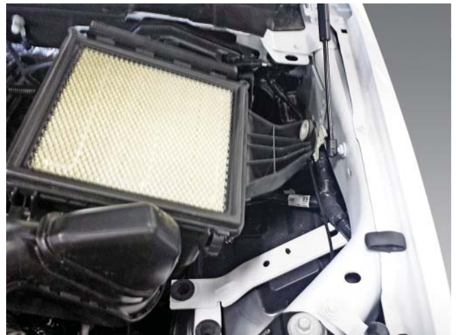
11. Remove the self-tapping screw retaining the dirty air inlet onto the lower air box.