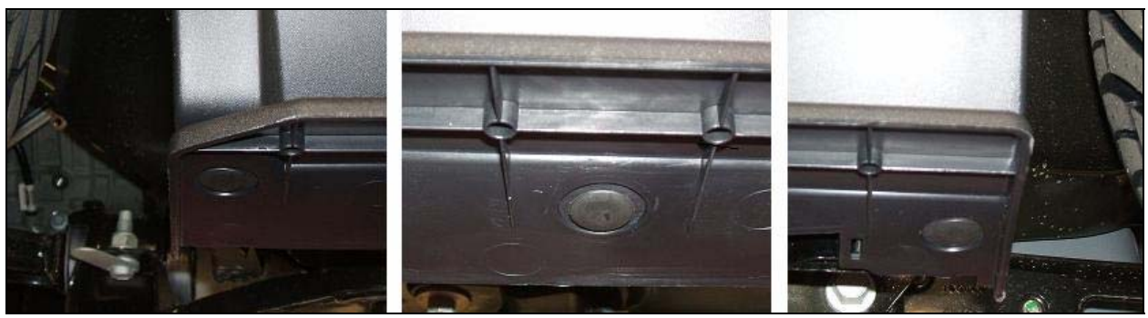
(Three of five Push Pins shown.) Figures 9

11. Install a new Push Pin into each of the five (5) drilled holes. Refer to Figures 9.