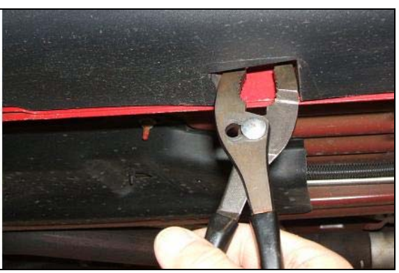
(One push pin shown, all others are similar)