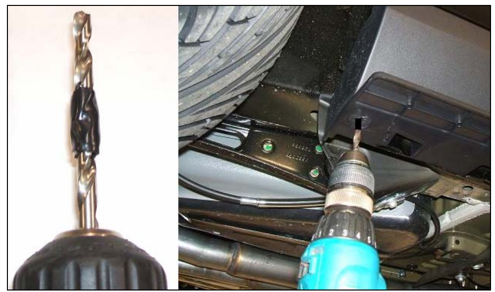
(Rear hole shown, others are similar) Figures 8

Assembly Tip: Place several wraps of electrical tape 1" from the tip of the drill bit to act as a drill stop. Refer to Figures 8.